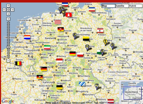
Map with all facilities of the database

www.solar-yield.eu is the probably largest international photovoltaic revenue database. You can register and join with your photovoltaic facility for free and contribute therewith to the further success of Solar-Yield. Solar-yield offers you many nationwide comparisons and statistics.