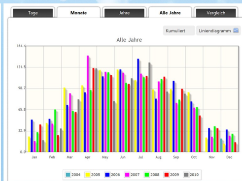
Direct comparison of your facility in a certain period