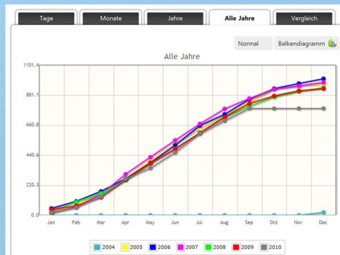
Direct comparison of your facility in a certain period